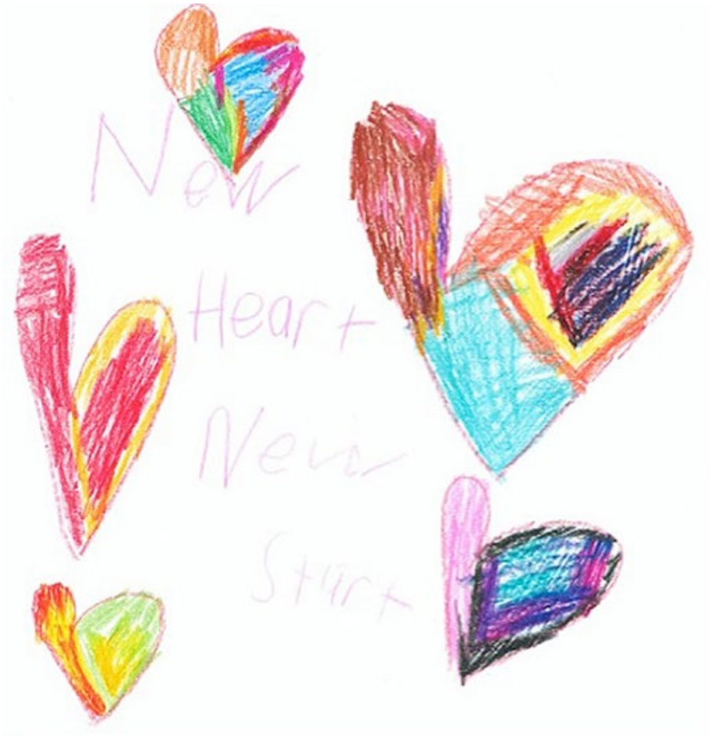
Original Artwork by a young heart transplant recipient